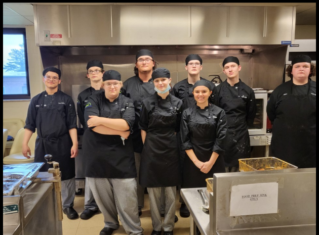
(above) Culinary Arts students posing in the kitchen on the evening of the Alternative Educational Academy prom.

The students did a fantastic job and were very professional. They were able to get a couple different catering experiences with these projects. One was a buffet style banquet with a Southern Country theme menu; seasoned baked chicken, baked macaroni and cheese, southern style green beans and apple crisp.