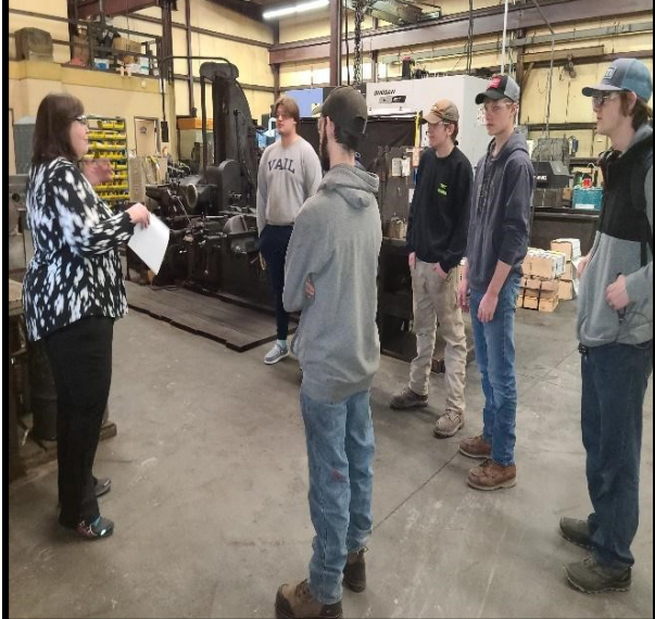
(above) Students engaged during the Almo Manufacturing presentation.