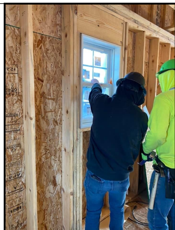
Students installing windows during their inhouse skills competition.

Immediately following the roof installation, the construction trades students began their in-house skills competition. Students were broken into teams of 5-6 students, a second year student named the crew leader, and each group assigned an exterior side of the home for the competition. Teams were required to complete the following tasks; soffit and fascia installation, windows and doors, Azek trim, and siding installation. The competition included two elements. First, the team competition which was judged by the instructor, industry professional, and an advisory board member. Students competed with one another based upon craftsmanship, teamwork, problem-solving skills, progress, and limited waste of materials. Second, a leadership competition between the crew leaders based upon labor usage, lost time, direction of crew members, knowledge and problem solving within the trades, and on-schedule delivery of the finished product. All groups did a great job and only a few points separated the winners from their classmates. Prizes were issued to the winning team and the crew leader.