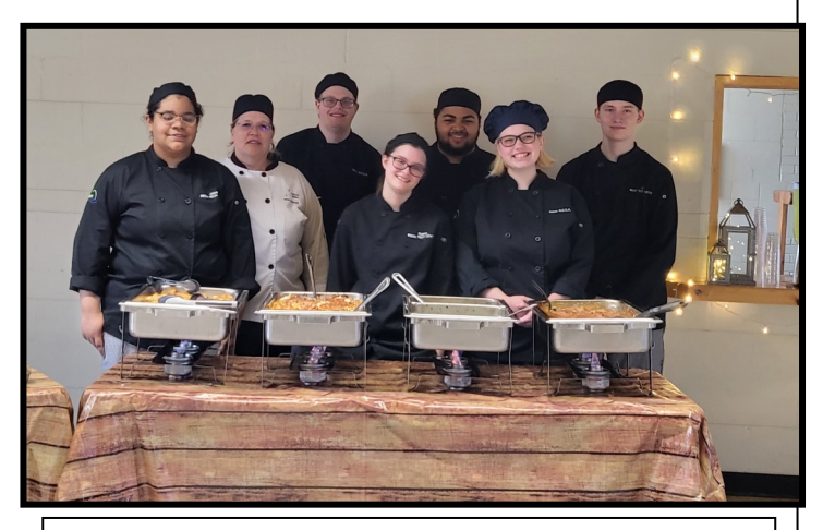
(above) Student volunteers worked hard preparing food to cater the Hale High School prom.