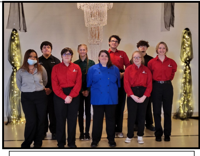
(above) Culinary Arts students part 2 of the final exam was to cater a banquet. The students catered the Alternative Educational Academy Prom on May 20th.

banquet with a "Night of Stars" theme. That menu consisted of fresh green tossed salad, creamy penne chicken alfredo with a side of broccoli, and decadent black forest cake. The students worked so hard outside of school hours, working long days and battling the humidity and heat. Both caterings also gave them the experience of working offsite in an unfamiliar kitchen setting. It truly was a great experience for them.